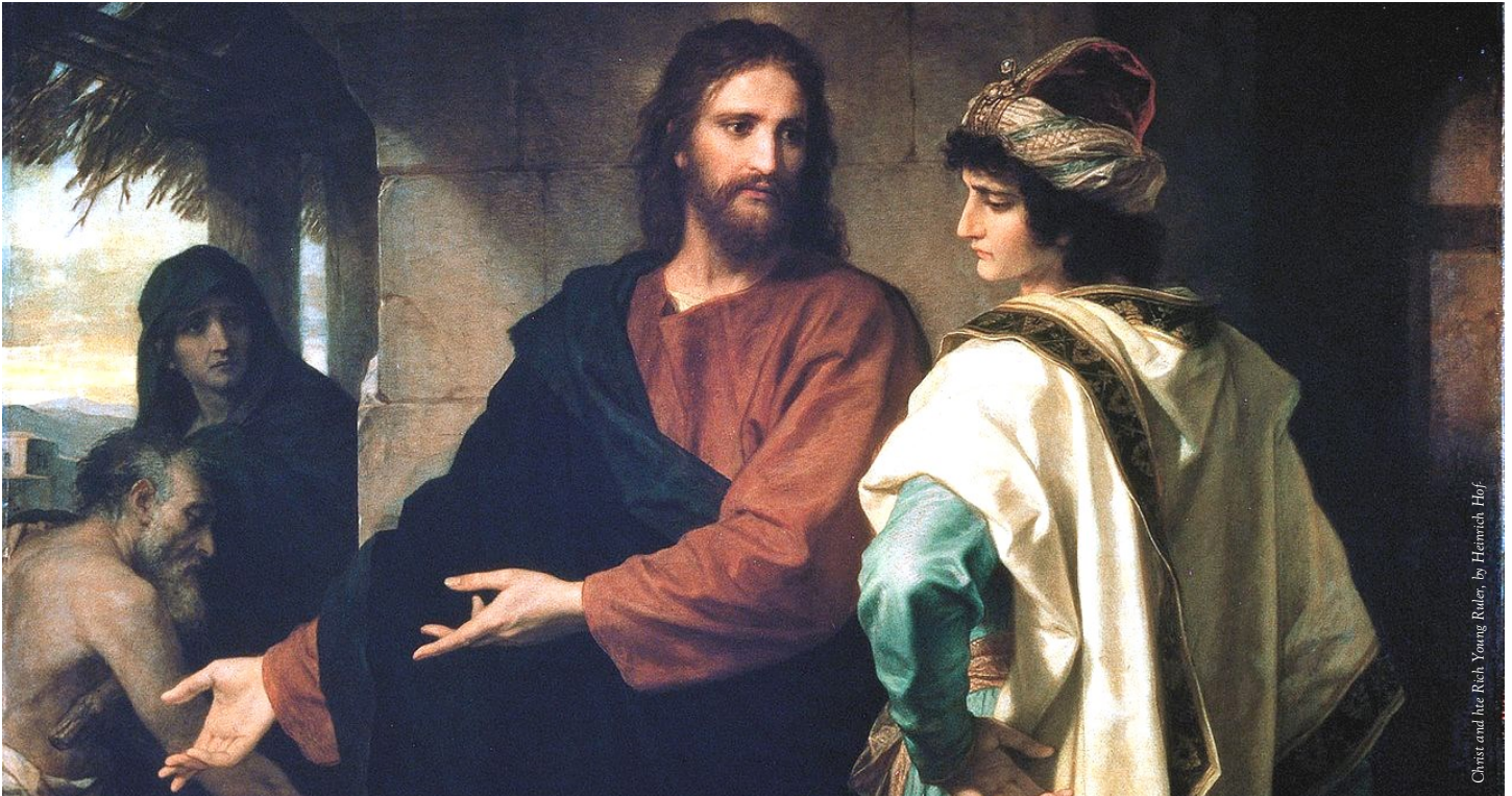
Christ and the Rich Young Ruler, by Heinrich Hof